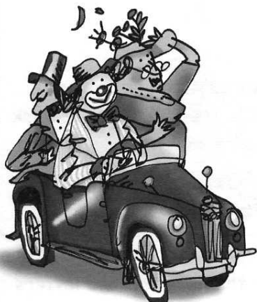
start the car

2. car, bar, star, park, smart, start, sharp, spark