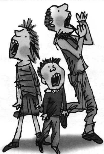
sh ou t it ou t

2. ou t, sh ou t, lou d, mo uth, rou nd, fo und