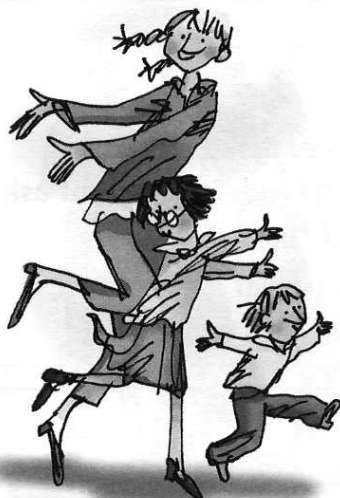
whirl and twirl

2. girl, bird, third, whirl, twirl, dirt