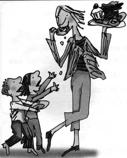
that's not fair