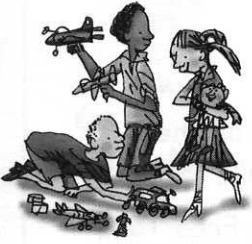
may I play?

2. day, play, may, way, lay, say, tray, spray