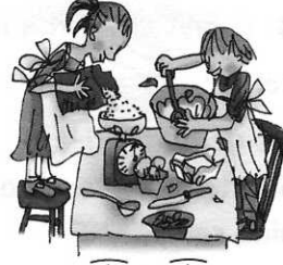
make a cake

3. make, shake, cake, name, same, game, save, brave, late, date