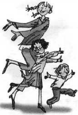
whirl and twirl

2. girl, bird, third, whirl, twirl, dirt