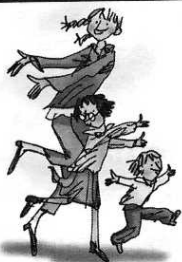
whirl and twirl

2. girl, bird, third, whirl, twirl, dirt