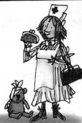
nurse with a purse

3. burn, turn, lurk, hurt, burn, burp, slurp, nurse, purse, hurt