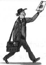
a better letter

3. over, never, better, weather, after, hamster, litter, proper, corner, supper