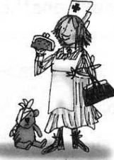
nurse with a purse

3. burn, turn, lurk, hurl, burn, burp, slurp, nurse, purse, hurt