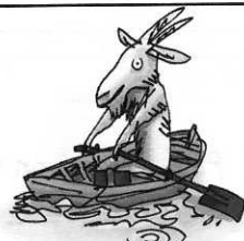
goat in a boat

3. toad , oak , road , cloak , throat , roast , toast , loaf , coat , coal , coach