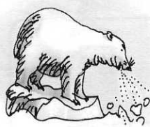
blow the snow

2. blow , snow , slow , show , know , flow , glow